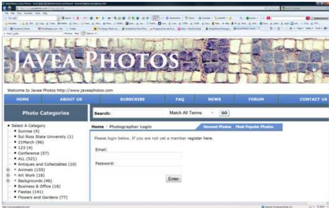
Above: Login Screen & Below: What you should see after login